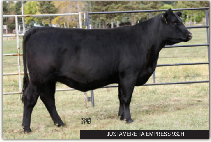
JUSTAMERE TA EMPRESS 930H

Due early January to Sankey's Watchmen 7020