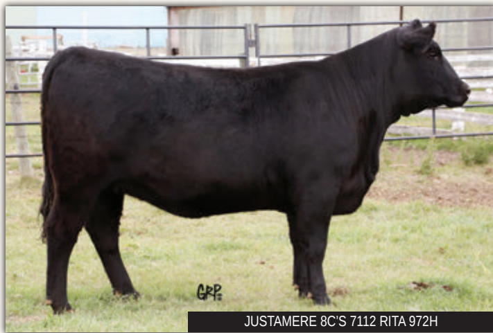
JUSTAMERE 8C'S 7112 RITA 972H