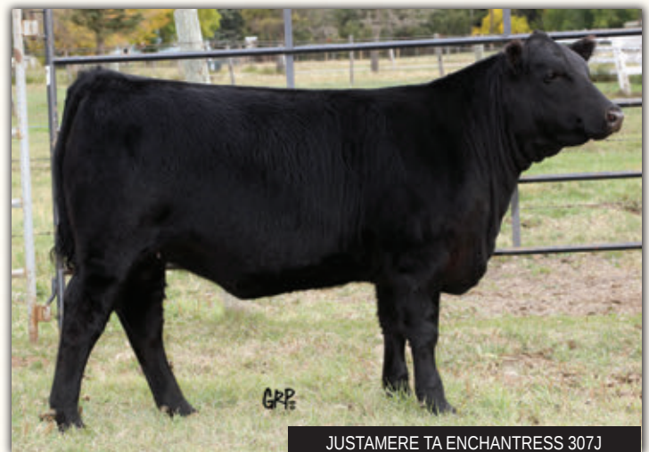
JUSTAMERE TA ENCHANTRESS 307J

This beautiful made daughter of Genex AI sire, Musgrave Stunner, is very eye appealing with a moderate build and excellent soundness of stride. She possesses a very well-balanced set of a EPD's and her mother, Justamere Enchantress is a past division Champion at the National show in 2016 and has produced very well for us and our partners Tuckaway Angus.