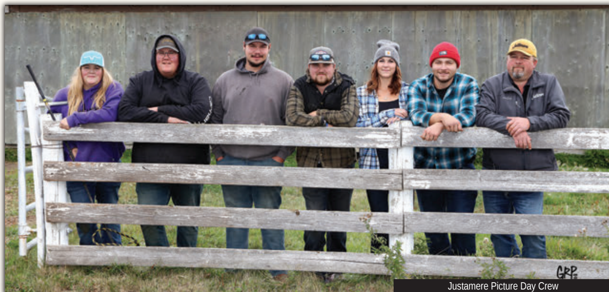
Justamere Picture Day Crew