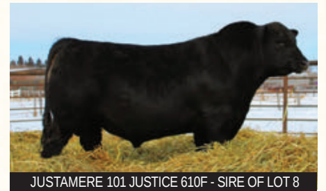
JUSTAMERE 101 JUSTICE 610F - SIRE OF LOT 8