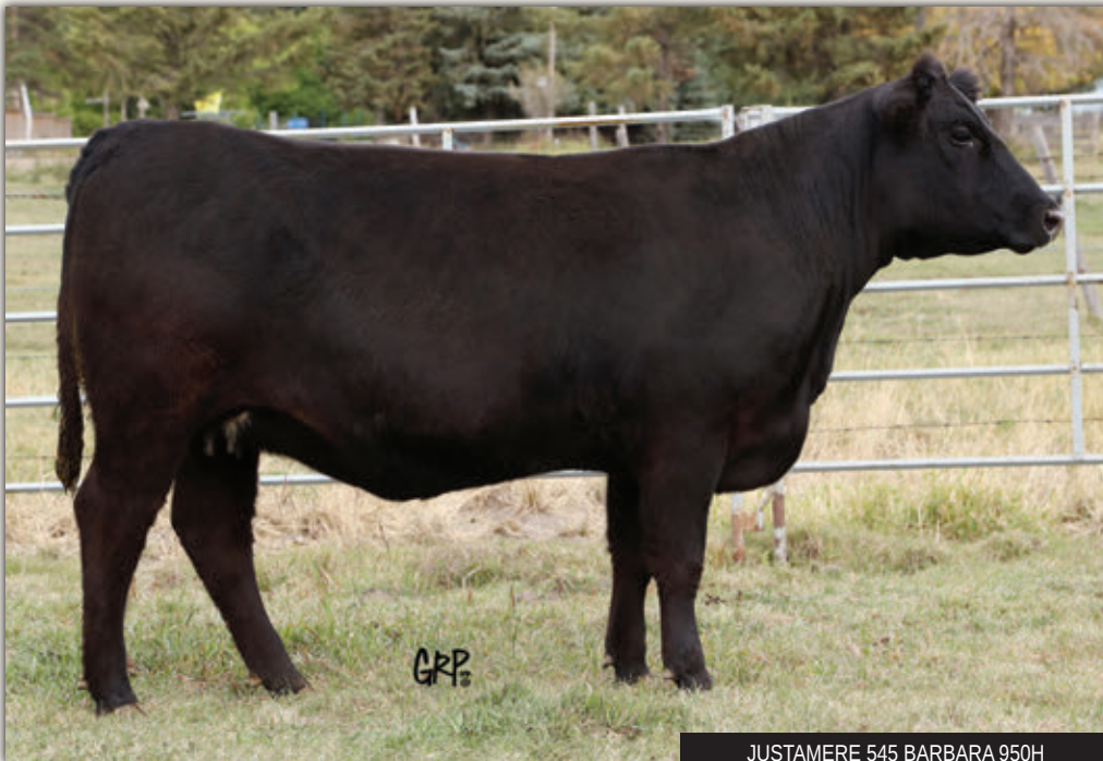
JUSTAMERE 545 BARBARA 950H

E X A R SCOTCH CAP 816 A J S ELBA 909 BASIN PRIME CUT 354K BARBARA OF PEAK DOT 942H