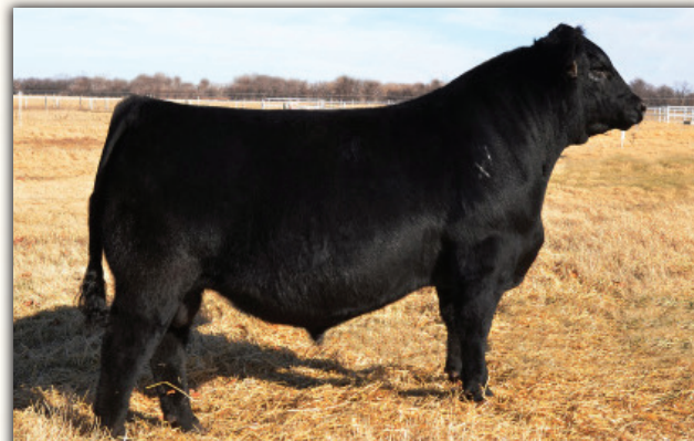
EXAR DENVER 2002B - PATERNAL GRANDISRE TO LOTS 24 & 25

Solid production figures behind this beautiful daughter of Mile High, her damn EXAR Rita is a very hard-working young female in a herd. This heifer is deep, thick and broody, just the way we want them all to be. Due mid March to EXAR Dry Valley 0302