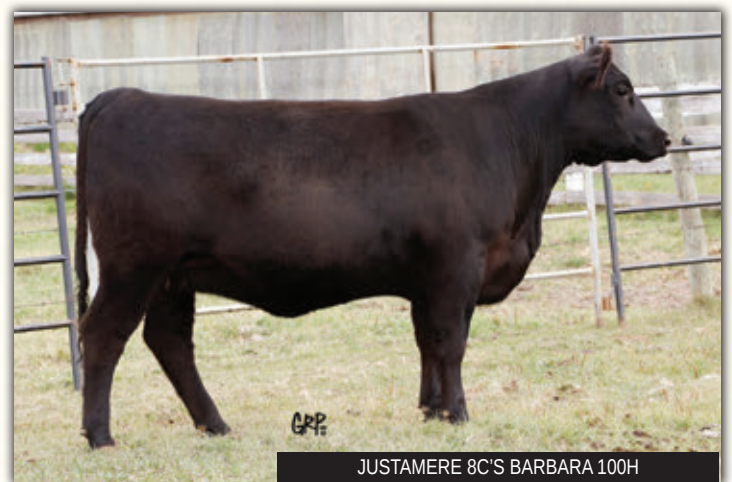
JUSTAMERE 8C'S BARBARA 100H

Due early January to Riverbend Upgrade 8605