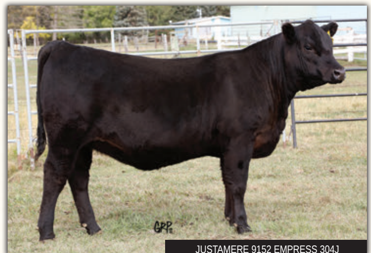
JUSTAMERE 9152 EMPRESS 304J