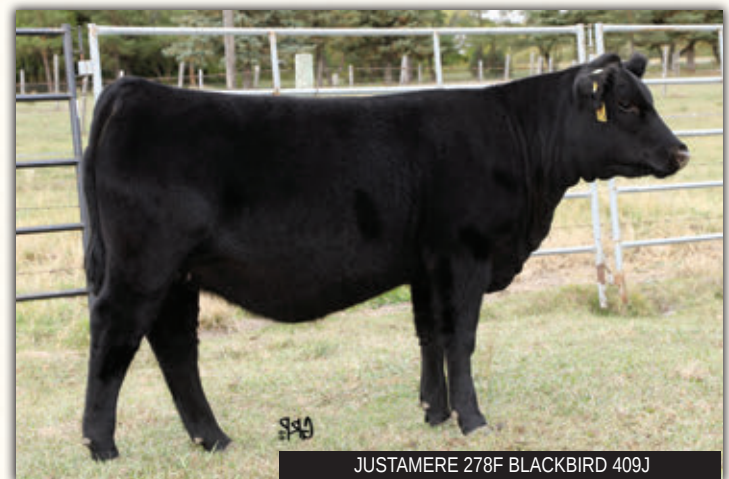
JUSTAMERE 278F BLACKBIRD 409J