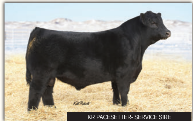
KR PACESETTER- SERVICE SIRE

Sired by the CWA Supreme Champion EF Titan 545 and tracing back to Justamere L547 Barbara 855T who has delivered numerous top end females and bulls over her 13 years of production never missing once. For reliability and longevity you won't go wrong with this female. Due January 1, 2022 to KR Pacesetter