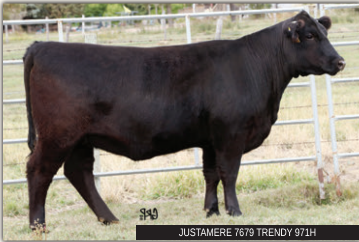
JUSTAMERE 7679 TRENDY 971H