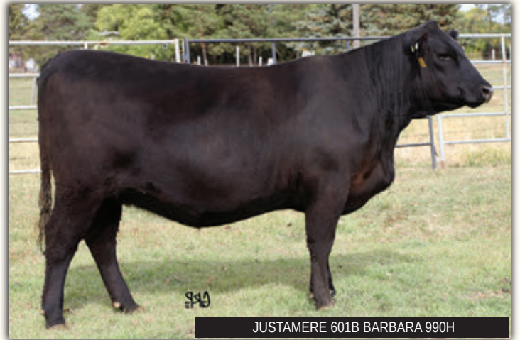
JUSTAMERE 601B BARBARA 990H

Due early January to Riverbend Upgrade 8605