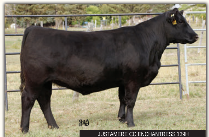
JUSTAMERE CC ENCHANTRESS 139H

Due end of January to EXAR Entitlement 9743