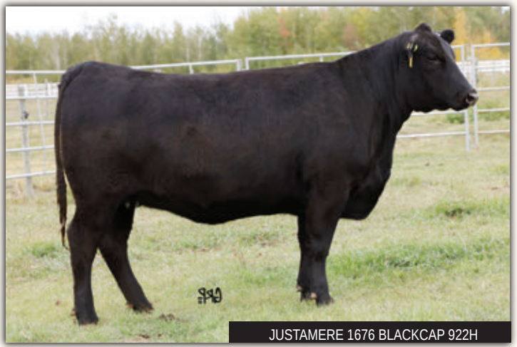
JUSTAMERE 1676 BLACKCAP 922H

Due early January to EXAR Dry Valley 0302B. Terms to be announced.