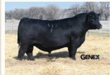
Service Sire - Sitz Barricade 632F

You cannot go wrong. Due Early January to Sitz Barricade 632F