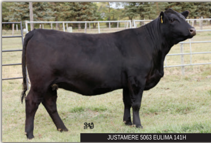
JUSTAMERE 5063 EULIMA 141H