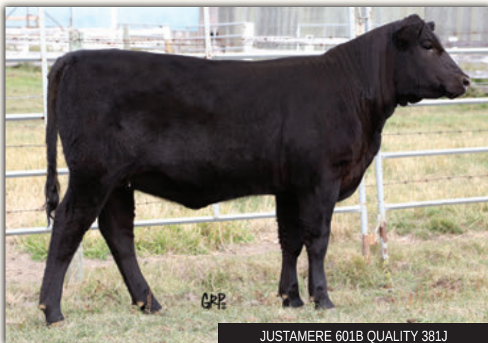
JUSTAMERE 601B QUALITY 381J

This big performance Canadian pedigree female offers loads of performance. And out cross pedigree with a great otter and feet and leg structure. Due early January to EXAR Resistol 0829