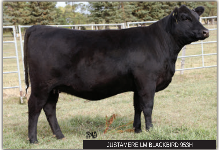
JUSTAMERE LM BLACKBIRD 953H

PLAINVIEW LUTTON E102 PVF PROVEN QUEEN 786 DAMERON FIRST CLASS GREENS PRINCESS 1012 CONNEALY CONSENSUS BLUE LILLY OF CONANGA 16 BALDRIDGE KABOOM K243 KCF RIVERBEND BLACKBIRD 2204