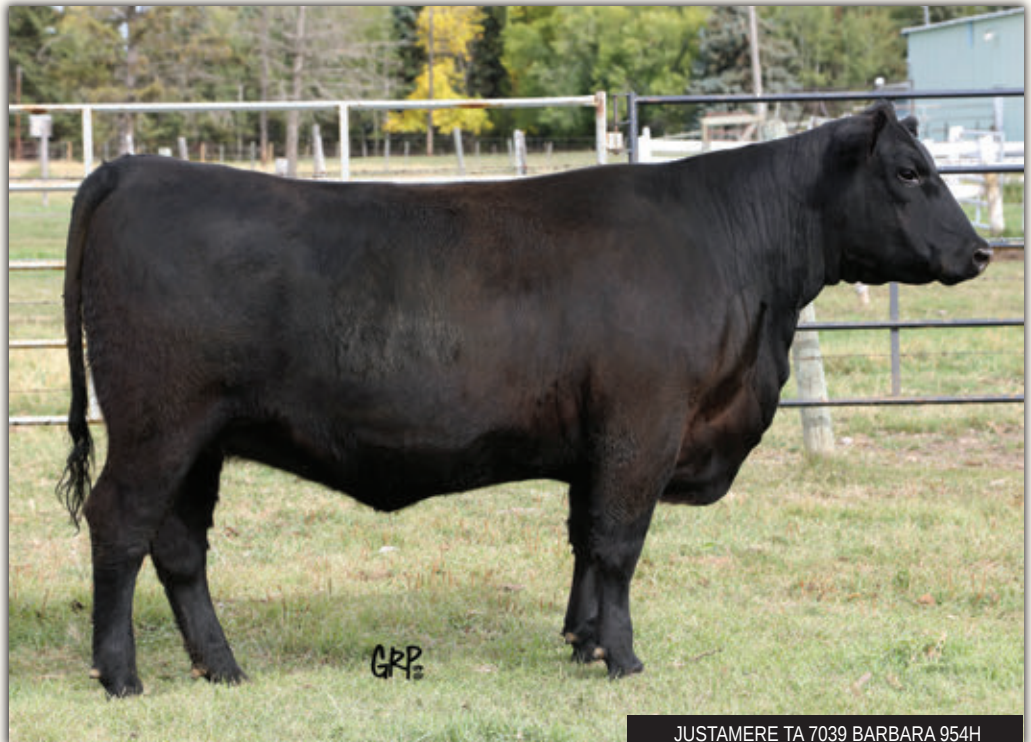
JUSTAMERE TA 7039 BARBARA 954H

PVF INSIGHT 0129 EXAR BLACKCAP 9840 EXAR FORTIFY 1447B EXAR MISS BARBARA 1075