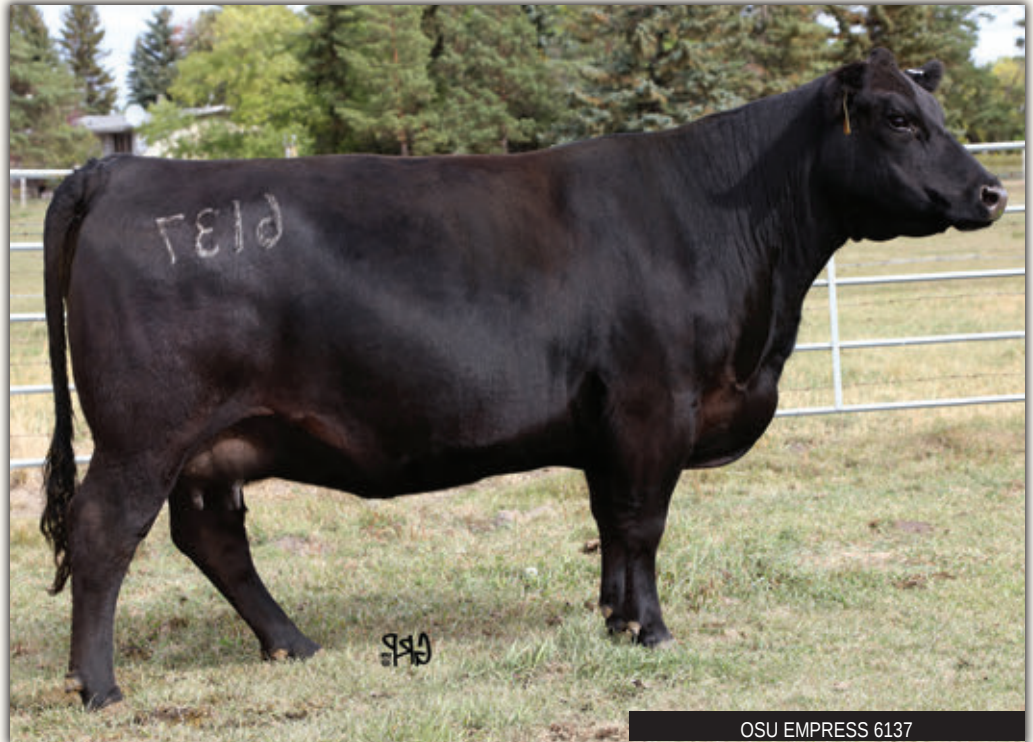
OSU EMPRESS 6137

This beautiful OSU Empress female is in her prime. A daughter of EXAR Resitol, you cannot write a better, more productive pedigree. Then you look at her and you realize she is amazing. Beautiful fronted, long and deep on perfect feet and legs with a near perfect udder. We are having a hard time offering her this year. Her heifer calf at side is an absolute sweetheart. AI to EXAR Express Way March 24, 2021 Exposed to Justamere Overdrive 504F Due early January