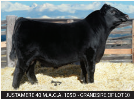
JUSTAMERE 40 M.A.G.A. 105D - GRANDSIRE OF LOT 10