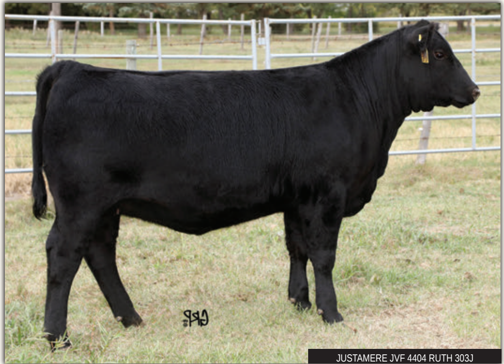
JUSTAMERE JVF 4404 RUTH 303J

Definitely a great start to our show heifer section of SOTY 2021.