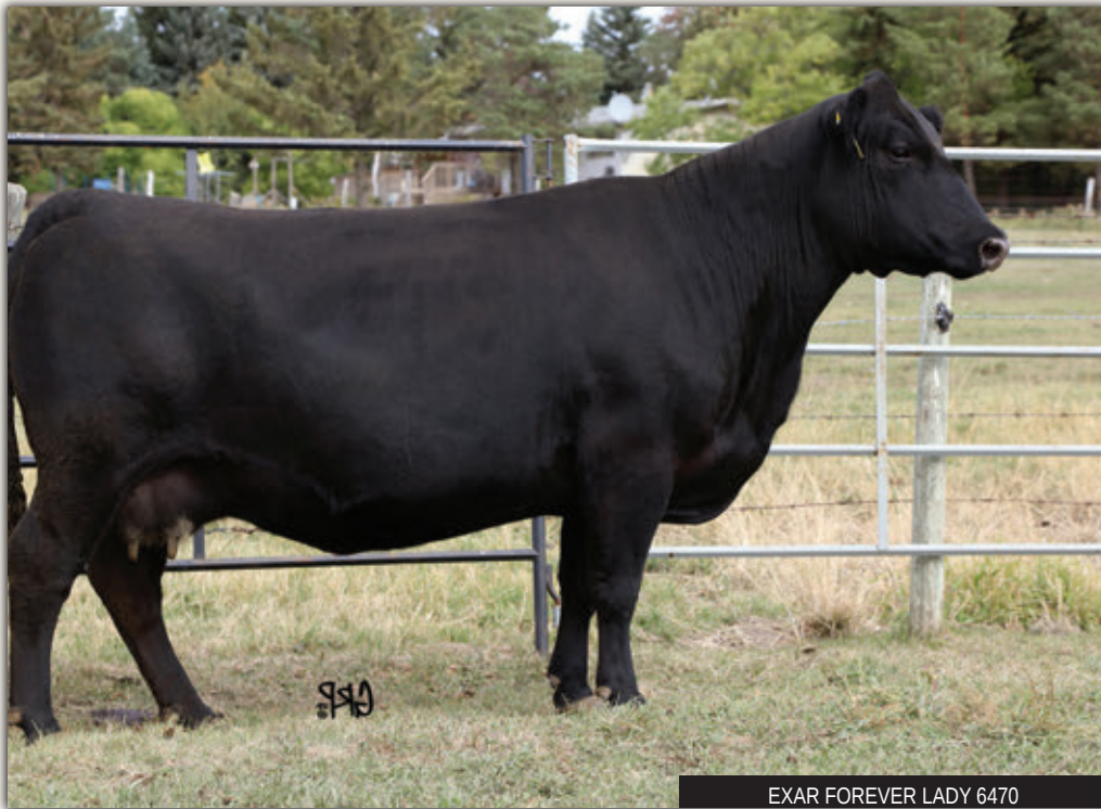
EXAR FOREVER LADY 6470

SYDGEN C C & 7 ERICA OF ELLSTON C124 BC 7022 RAVEN 7965 EXAR FOREVER LADY 5563