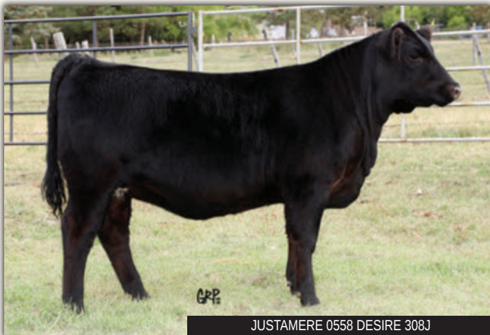
JUSTAMERE 0558 DESIRE 308J