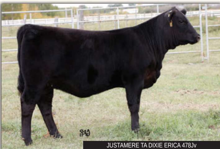
JUSTAMERE TA DIXIE ERICA 478Jv