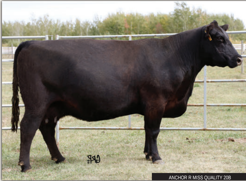
ANCHOR R MISS QUALITY 20B

LOOKOUT PACESETTER 258M CRESCENT CREEK EULA 71R CRESCENT CREEK SCOTCHMAN 26R SANDY BAR MISS QUALITY 90N