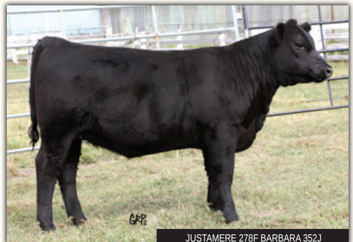
JUSTAMERE 278F BARBARA 352J

We pictured every animal in the sale this year. We feel the quality is very deep throughout this heifer calf by the Supreme Champion Bull in 2020 HLC GQ. She needs a show halter hung on her.