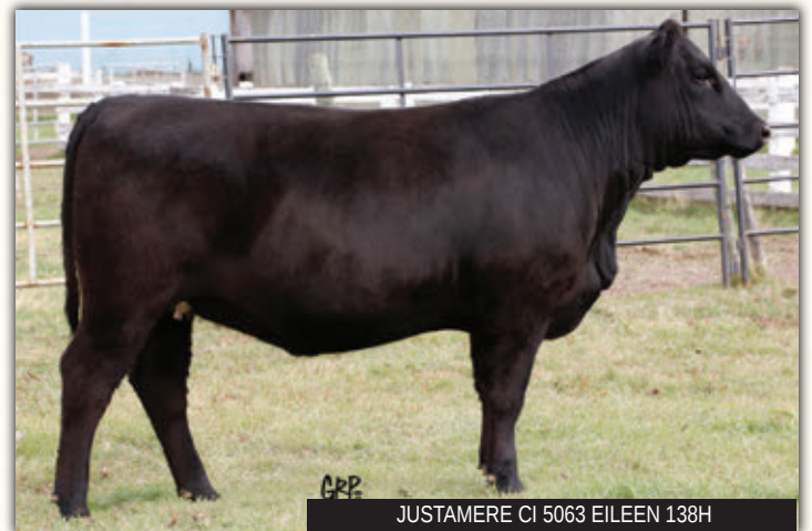
JUSTAMERE CI 5063 EILEEN 138H

Due early January to Greenwood High Class 87H