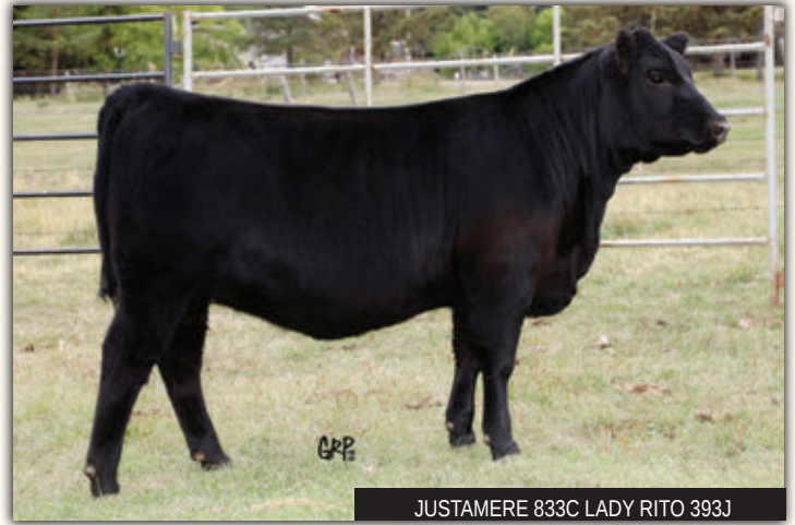
JUSTAMERE 833C LADY RITO 393J

Switching gears into this fabulous February daughter of Justamere South Dakota. She is really nice made, long and deep out of a past show female from ourselves and Still Meadows Farm. She will be a great addition to any show program as well as a top producer for you. Going to be tough competition in the February class.