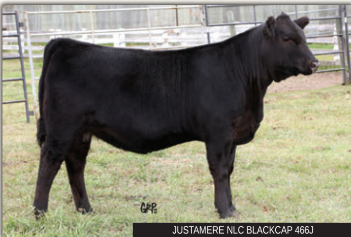
JUSTAMERE NLC BLACKCAP 466J