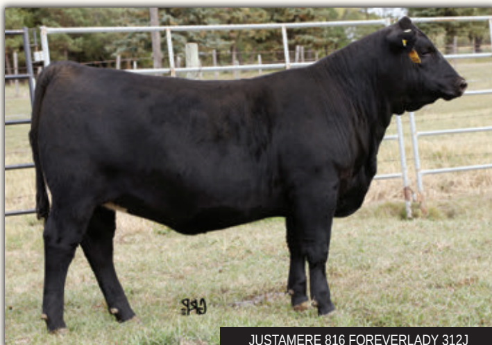
JUSTAMERE 816 FOREVERLADY 312J