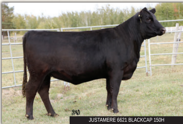
JUSTAMERE 6621 BLACKCAP 150H

This powerful heifer traces back to our great Allegra of Tullamore 30W who is the dam to the $140,000 Justamere Full Throttle 486A, and donor dam to countless other great cattle in this breed. She is carrying early service to Justamere Resource, a bull that you will see this fall on the show road. Due early January to Justamere Resource 907H