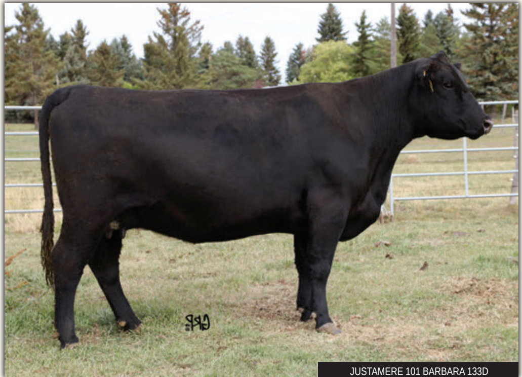
JUSTAMERE 101 BARBARA 133D

From the heart of our cowherd this daughter of Justified is all business. From the EXAR Barbara cow family, she is without a doubt and above average production female. Carrying service to EXAR Resistol 0829. Due January 24, 2022