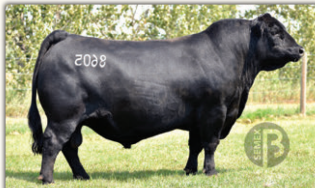
RIVERBEND UPGRADE 8605 - SERVICE SIRE TO LOTS 22 & 23