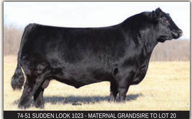
74-51 SUDDEN LOOK 1023 - MATERNAL GRANDSIRE TO LOT 20