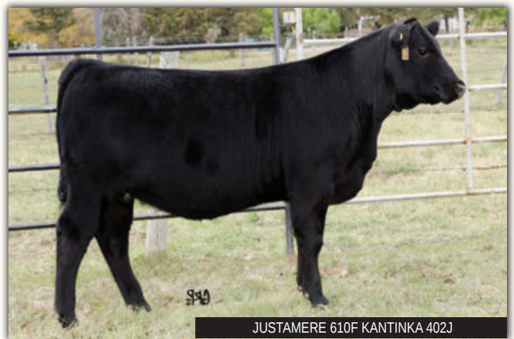
JUSTAMERE 610F KATINKA 402J

This daughter of the $56,000 Justamere's Justice 610F is a wonderful addition to the Sale Of The Year. So easy to look at, very correct in her make up. Her mother EXAR Katinka 4010 has been a steady producer of the good ones for us. She will turn your head and get you fired up.