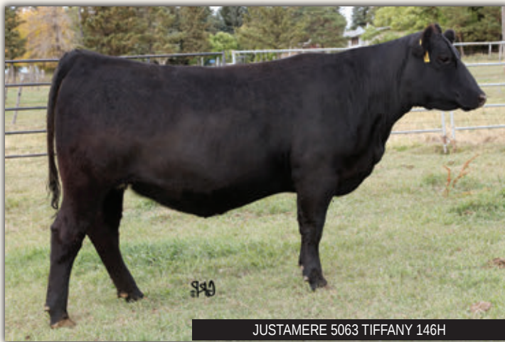
JUSTAMERE 5063 TIFFANY 146H

These EXAR Inspiration daughters are like peas in a pod and everyone of them is good. Her hard-working Connealy Thunder dam has another great herdsire prospect at side this fall. These are the right kind to add to your program. Due early January to Greenwood High Class 87H