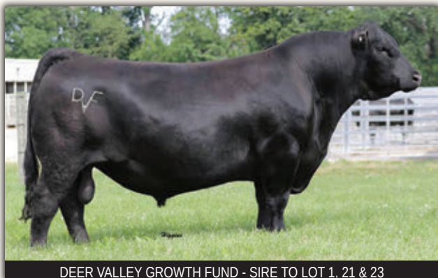
DEER VALLEY GROWTH FUND - SIRE TO LOT 1, 21 & 23

Due end of February to EXAR Dry Valley 0302