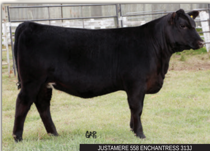
JUSTAMERE 558 ENCHANTRESS 313J