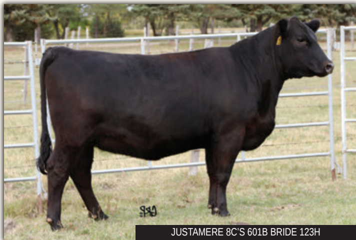
JUSTAMERE 8C'S 601B BRIDE 123H