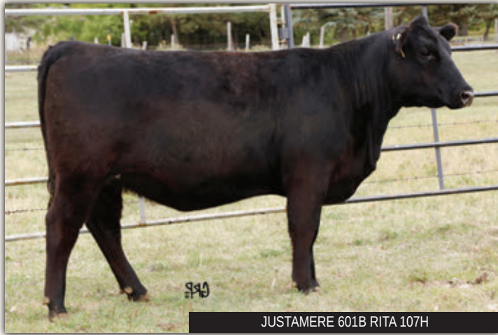
JUSTAMERE 601B RITA 107H