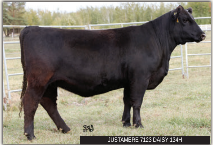
JUSTAMERE 7123 DAISY 134H