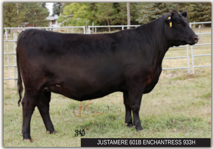
JUSTAMERE 601B ENCHANTRESS 933H

Due early January to Baldrige Moving On G780