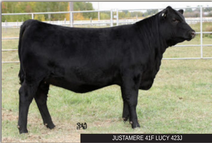
JUSTAMERE 41F LUCY 423J

You can't go wrong with this type of cattle.