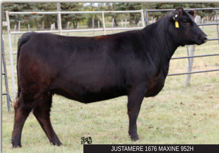
JUSTAMERE 1676 MAXINE 952H